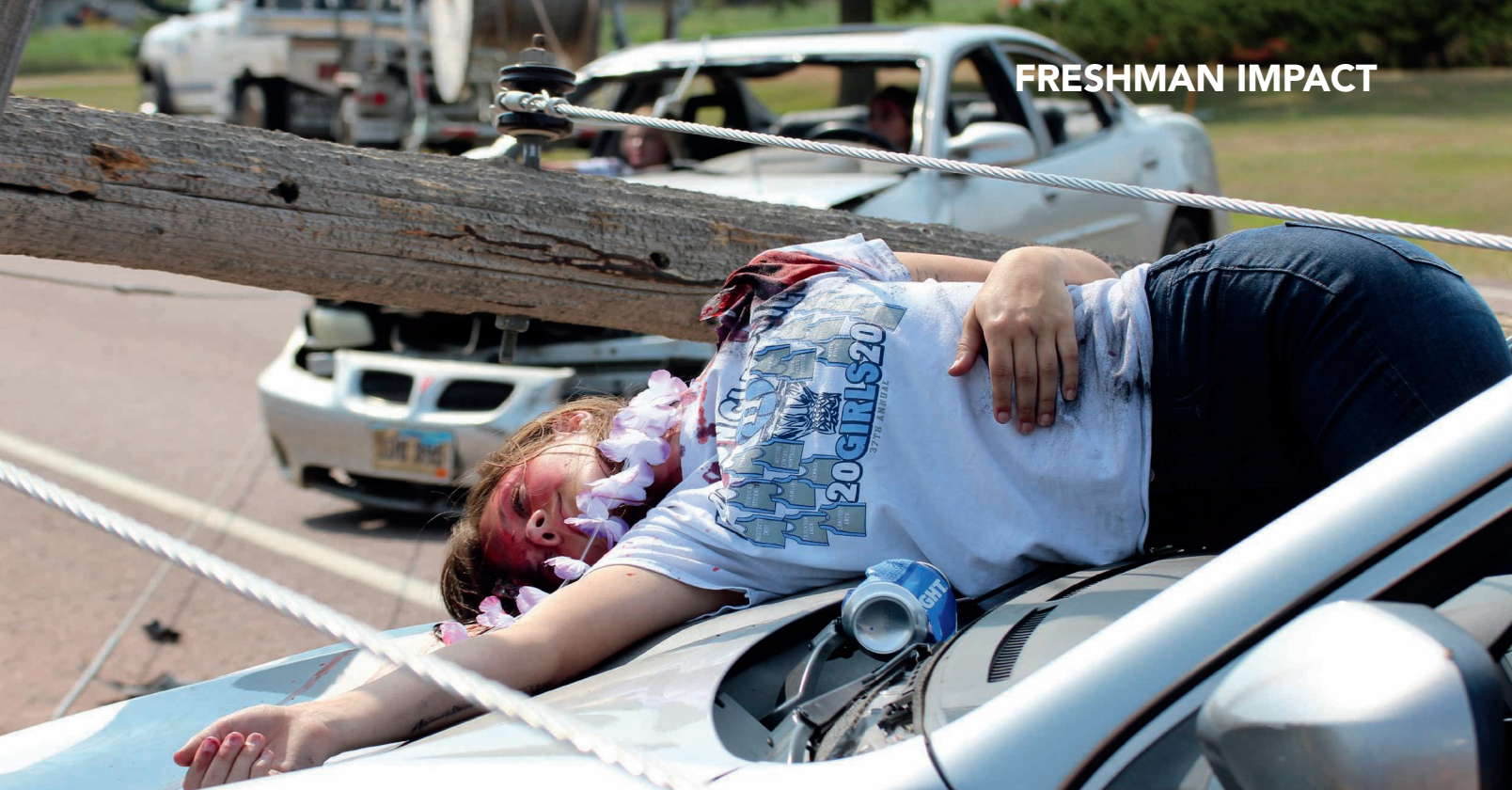
A Hanson High School student takes on the role of an accident victim during a recent mock emergency scenario.

facilitate the partnership while working alongside local organizers.