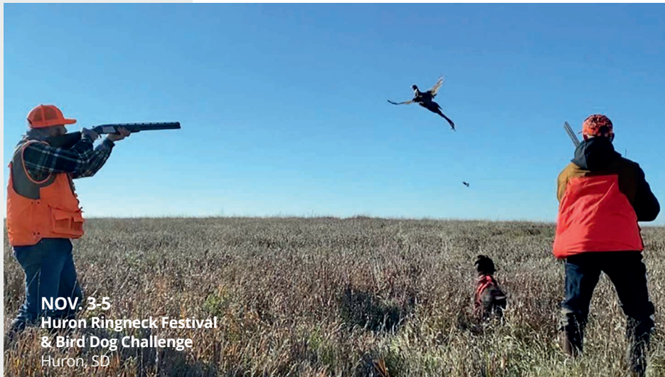
NOV. 3-5 Huron Ringneck Festival & Bird Dog Challenge Huron, SD

To have your event listed on this page, send complete information, including date, event, place and contact to your local electric cooperative. Include your name, address and daytime telephone number. Information must be submitted at least eight weeks prior to your event. Please call ahead to confirm date, time and location of event.