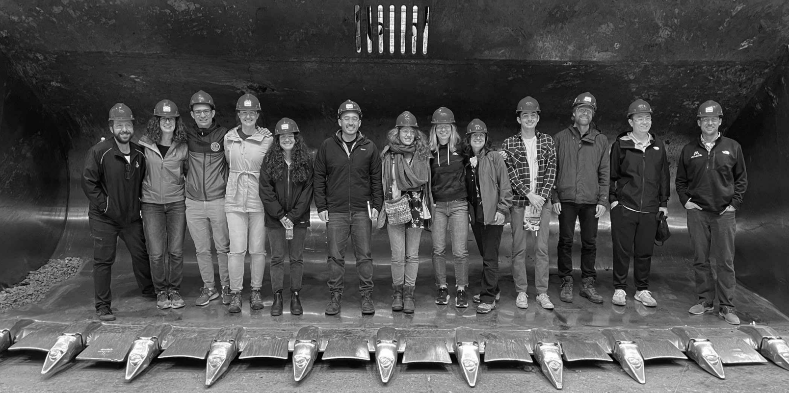
University of Minnesota graduate students pose in a massive coal bucket during an electric cooperative tour sponsored by Renville-Sibley CPA and the university.