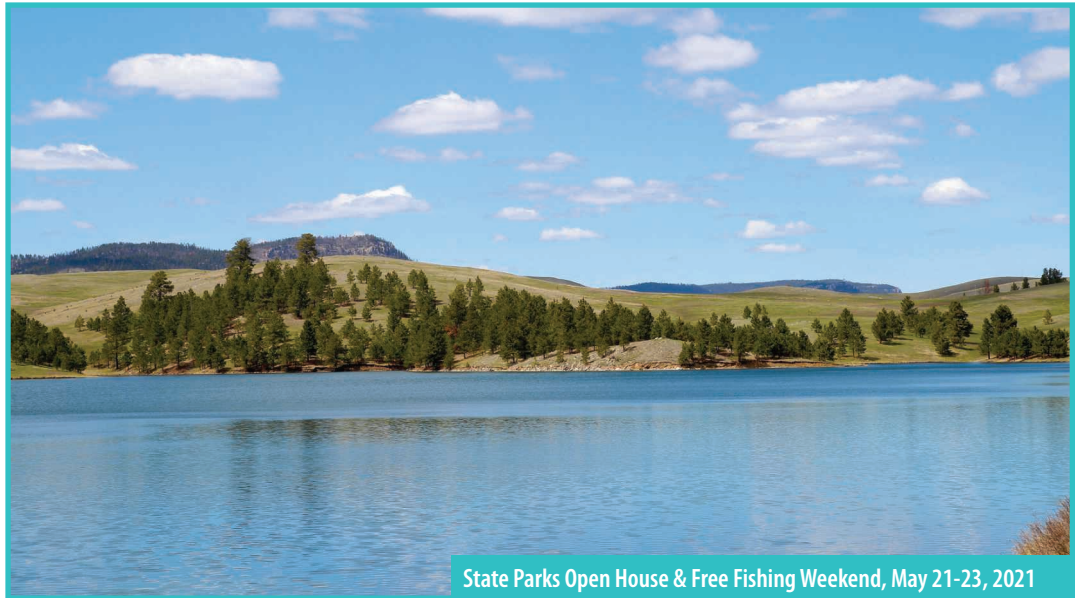
State Parks Open House & Free Fishing Weekend, May 21-23, 2021

Vermilion-Area Farmers Market - Plant Sale, High & Cherry Streets, Vermilion, SD 605-659-3399