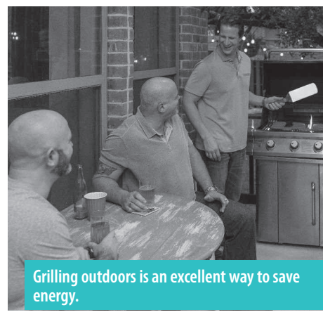
Grilling outdoors is an excellent way to save energy.

Hopefully these ideas will help you enjoy your outdoor living space this summer - and help you save energy!