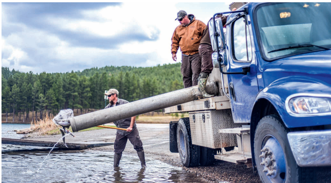
Game, Fish and Parks uses trucks equipped with livewells to stock fish directly into South Dakota fisheries across the state.

"Keep an eye out for new projects because they are happening and underway," he said. "And at the end of the day, it's all about maximizing the satisfaction of our customers, South Dakota's anglers."