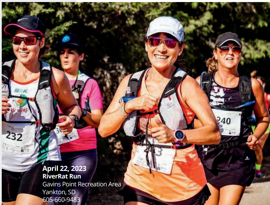
April 22, 2023 RiverRat Run Gavins Point Recreation Area Yankton, SD 605-660-9483

To have your event listed on this page, send complete information, including date, event, place and contact to your local electric cooperative. Include your name, address and daytime telephone number. Information must be submitted at least eight weeks prior to your event. Please call ahead to confirm date, time and location of event.