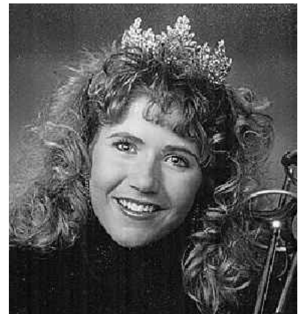
Gov. Kristi Noem was crowned the South Dakota Snow Queen in 1990.