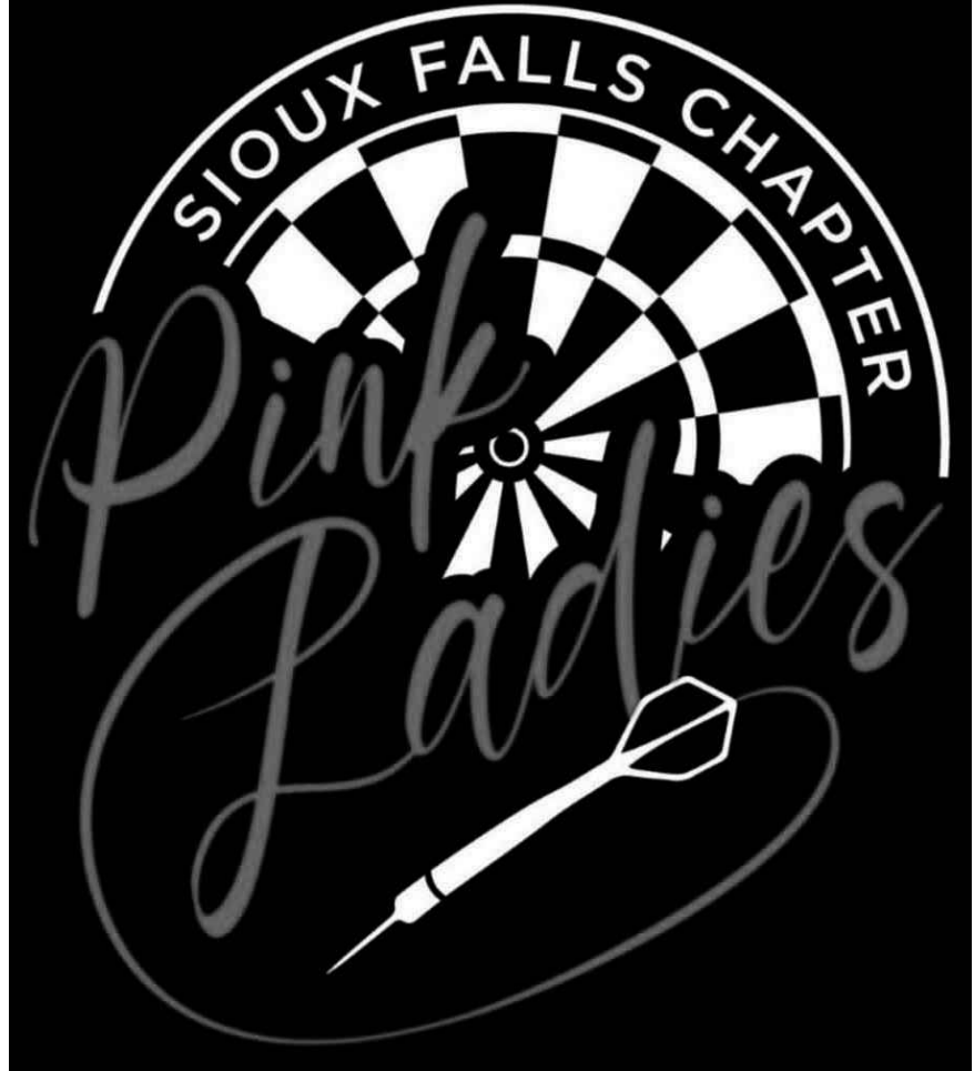
Sioux Falls Pink Ladies Dart League Logo

than $130,000 to those impacted by cancer.