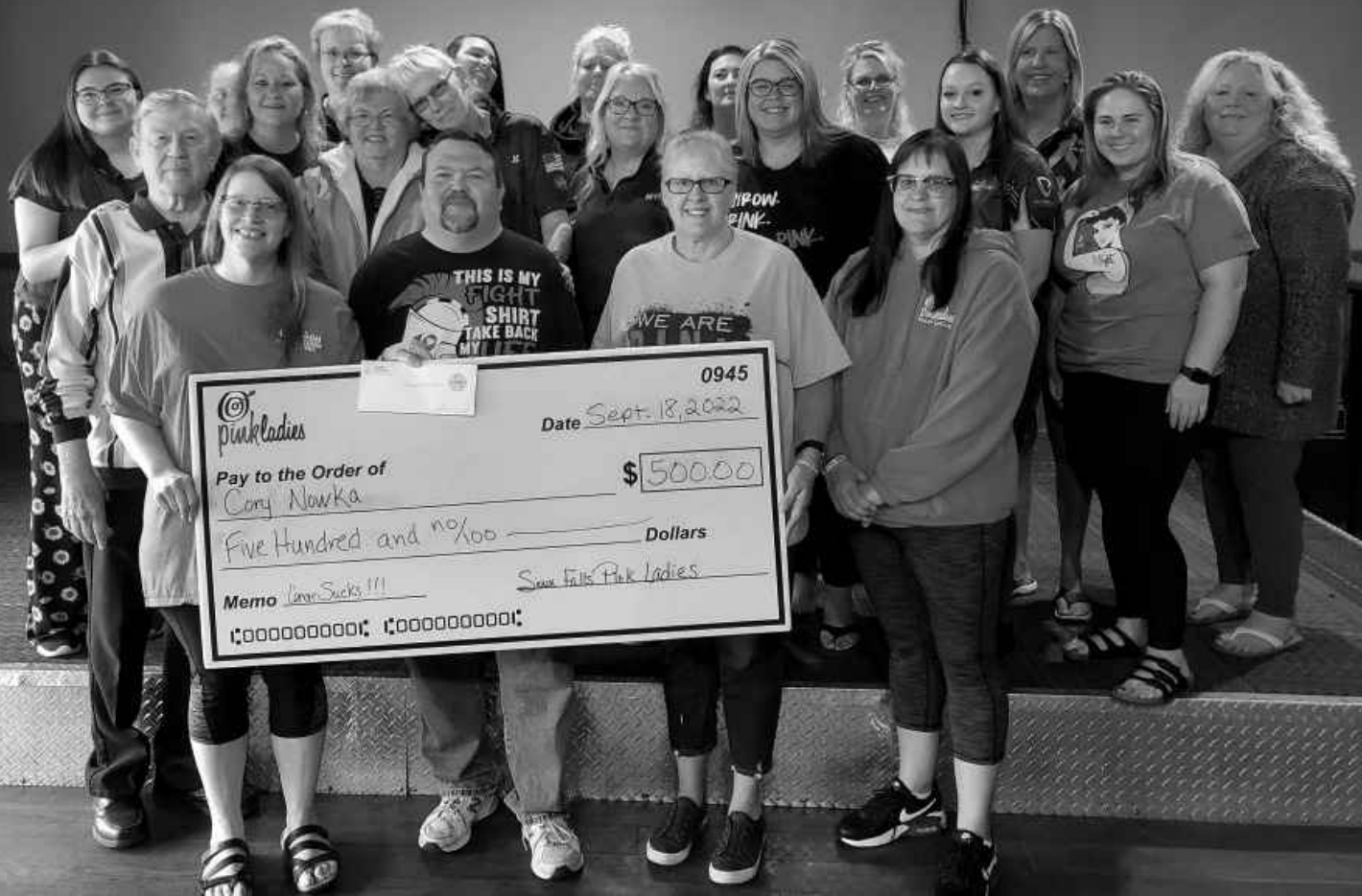
Members of the Sioux Falls Pink Ladies Dart League present a $500 check to area residents fighting cancer.