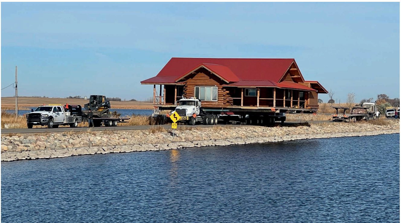
A home is moved due to flooding near Waubay, S.D.

Moving a structure can be an exciting process if done correctly. It’s saving a piece of history from destruction or putting in something new without the headache of waiting. Whatever the reason behind the move, the ability to do it is astounding. Homes can be saved, history can be preserved, and future options are made more available.