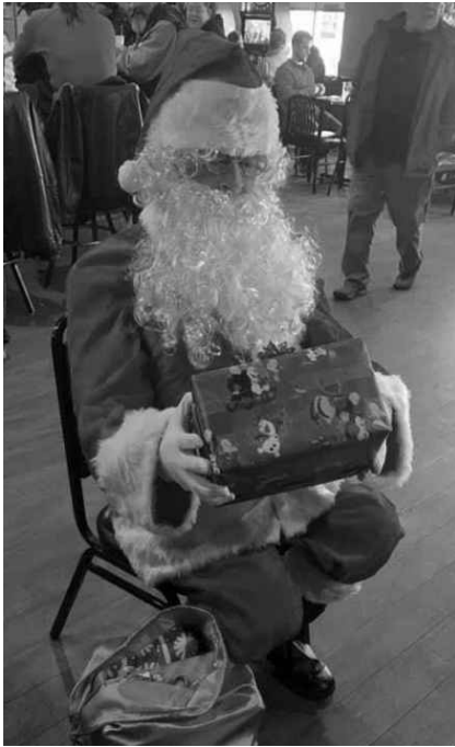
Even Santa sometimes visits the Sioux Falls Pink Ladies Dart League, gifting presents to families battling cancer.