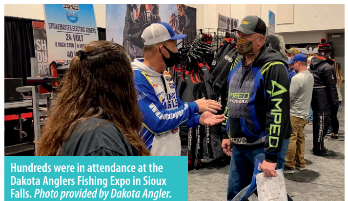
Hundreds were in attendance at the Dakota Anglers Fishing Expo in Sioux Falls.

Instead of a simple ice auger as a grand prize, today the tournament gives away roughly $225,000 in prizes, including Ice