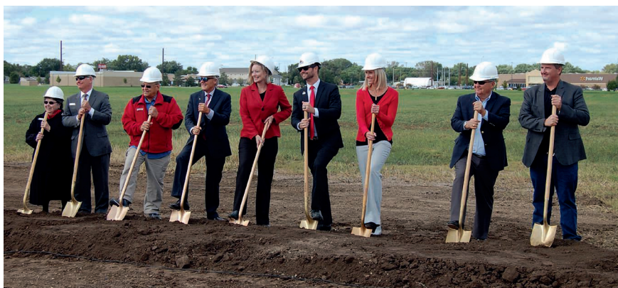
Participants celebrate the groundbreaking for the National Music Museum in Vermillion.

All of these impacts occur in counties where electric cooperatives operate, showcasing the substantial local economic benefits that co-ops provide in the communities they serve.