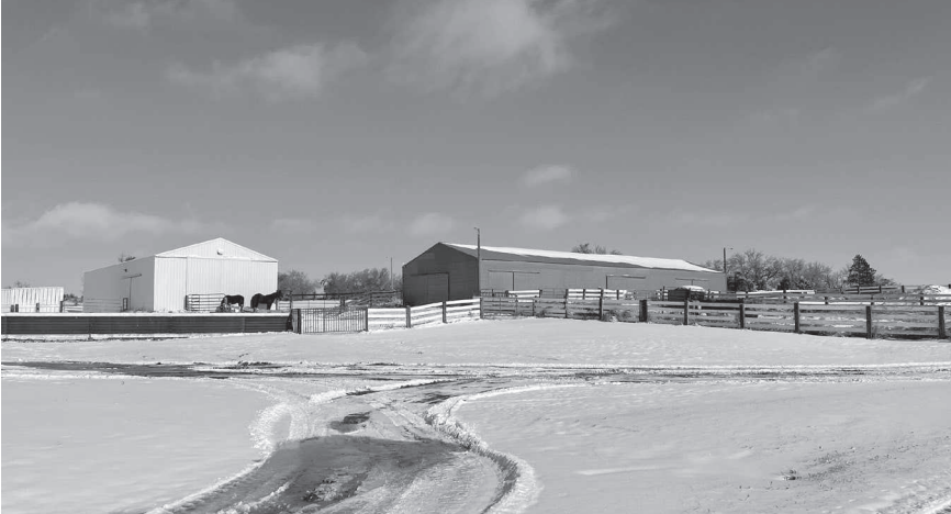
The Hendrickson-Seidel ranch is a sixth-generation operation in northwest South Dakota.

a cellphone, often without the cows ever knowing.