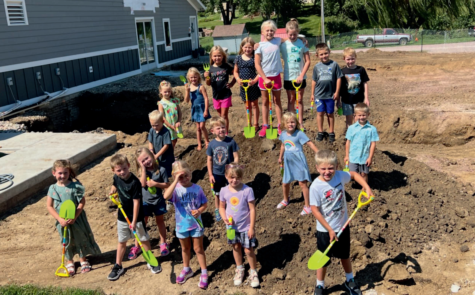
Garretson Childcare helpers are getting ready to help grow their daycare.