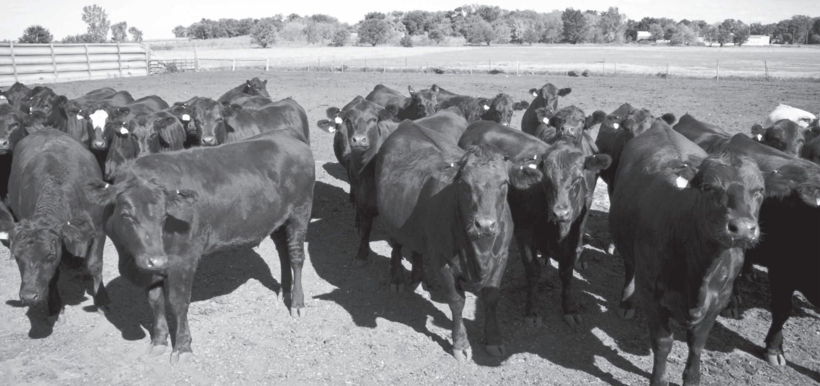
Cameras give producers the opportunity to monitor one of the ranch's most valuable assets: cows!