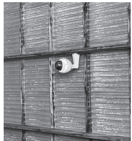
The Hendrickson family uses a camera to keep an eye on their cattle during the calving season.

Recent winters marked by challenging weather and significant snowfall have emphasized the role of cameras during the calving season. After all, it doesn't matter whether the sun is shining or a blizzard is rolling in, nature persists. Beyond staying warm, these cameras offer producers a less invasive method of observing their cattle, reducing the amount of stress put on cow and calf pairing. Installed in their barn, the Hendrickson's camera system streams live video of the cows straight to